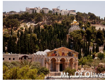
Mt. Of Olives